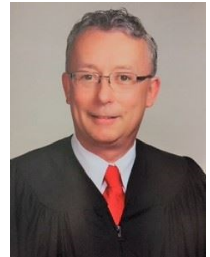
Judge Scott Altenburger Court of Common Pleas Juvenile / Probate

2044 North County Road 25A Troy, Ohio 45373 (937) 440-5651